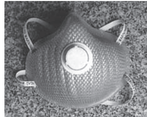
2300 DUST & MIST

A disposable that can last longer, so you save more. The 2200 doesn't collapse before the filter gets loaded. Holds its shape in heat and humidity. Straps are securely attached - won't break. RS2200: 20/box, 12 boxes/case, 240/case