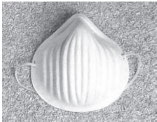
SRS8501-50Q NUISANCE DUST MASK

The molded nose bridge eliminates the need for a metal noseband. Has a naturally contoured shape for comfort. Ribbed construction increased durability. Large filter area allows cool, easy breathing and contains soft non-irritating fibres. 50 masks/box, 12 boxes/case, 600/case.