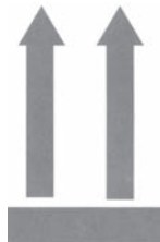
RW-216 4" x 6"