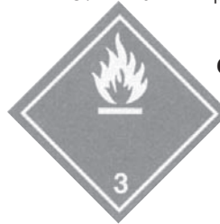
DG 3 Flammable Liquid

CUSTOM LABELS Please specify size, colours. Provide artwork