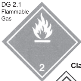
DG 2.1 Flammable Gas

Printed on white gloss label stock. 4" x 4", 500 per roll