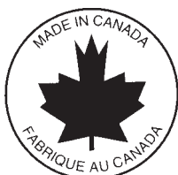
1 Colour RW-215 1" Circle 1000/roll Red Print