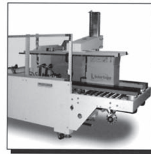
CE-12 Case Erector