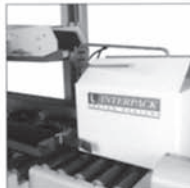
3 Flap folder