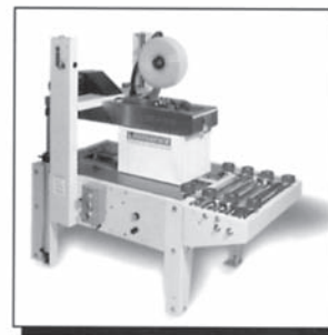
RSA 2024-TB Carton Sealer