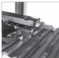
Infeed pack table

Interpack™ can provide them all, but better still, if you need an option that is not standard, we can custom build one from our special application group. Interpack Options are readily available, easy to install and pay for themselves in a short period of time.