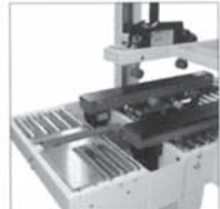
Powered exit table for case coding