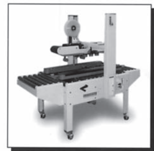
USA 2024-SB Carton Sealer