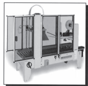
UA 262020-SB Carton Sealer

Intertape Polymer Group™ is an industry leader in the manufacture of both tape and packaging equipment. IPG's Interpack® brand of carton sealers offer an expanded line of machines specifically designed to meet all your corrugated carton processing needs. Choose from one of our four families of machines.