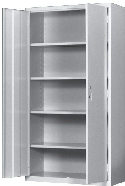
High Boy L190E-4 72"H x 36"W x 18"D

The popular Hi-boy. Versatility in a standard size. Complete with four adjustable shelves. Additional shelves available. 136 lbs.