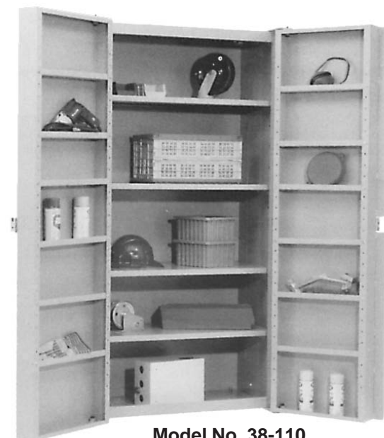
Model No. 38-110