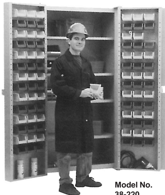
Model No. 38-220