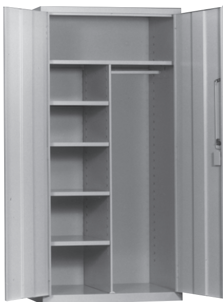
Combination L190-F 72"H x 36"W x 18"D

The popular Hi-boy. Versatility in a standard size. Complete with four adjustable shelves. Additional shelves available. 136 lbs.