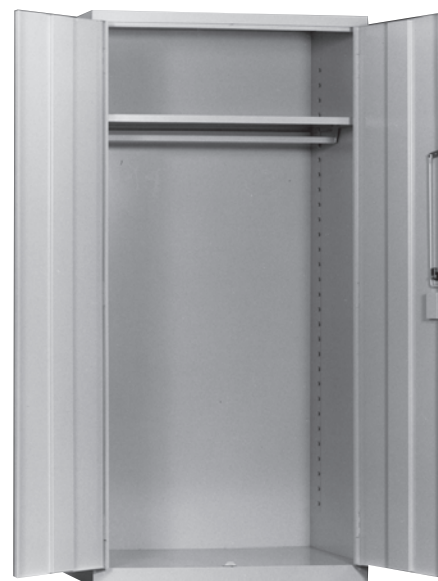
Wardrobe L190-G 72"H x 36"W x 18"D

The Combination. A storage cabinet and wardrobe in one unit. Complete with hat shelf, 1 coat rod and four half shelves. 140 lbs