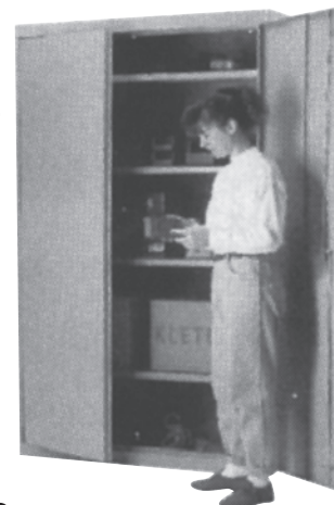
Model No. 51-200-G

Custom sizes and gauges available upon request