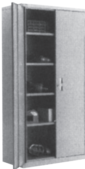
Model No. 27-100