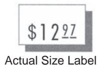
Actual Size Label