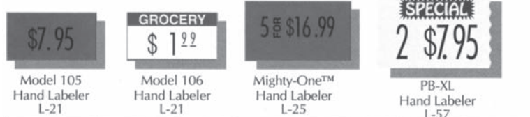
Model 105 Hand Labeller L-21