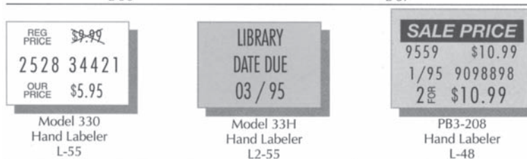
Model 330 Hand Labeller L-55