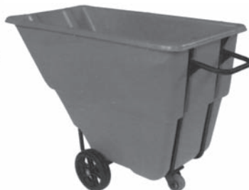
Heavy Duty 100 and 200 gal. feature 10" dia. molded rubber wheels with pin bearings and cast-iron hub. Axle 3/4" dia. solid-steel shaft.