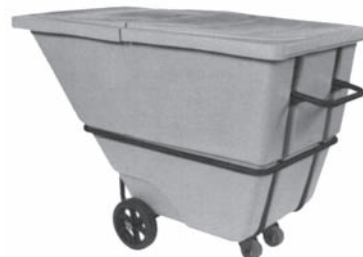
Super Heavy Duty 200 gal. features tubular steel side rails and two front wheels. Molded rubber wheels with pin bearings, and cast-iron hub. Axle 1" dia. solid-steel shaft.