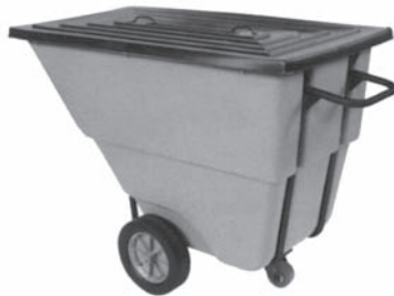
Med. Duty 100 and 200 gal. Wheels and Axles: feature 12" dia. wheels, plastic hubs, and semi-pneumatic tires with ball bearings. Axle 3/4" dia. solid-steel shaft.