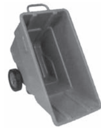
Akro-Tilt Trucks tip for easy manual emptying.