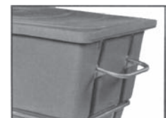
Full, wrap-around tubular frame is 1" treated steel reinforced with 3/4" pipe insert.

Convex shape adds strength and provides room for overpacking. Lid Models Medium Duty 100 and Heavy Duty 100 are one-piece (Colour: Black). Lid Models Medium Duty 200, Heavy Duty 200 and Super Heavy Duty 200 feature a two-piece lid (Colour: Grey). A full width, heavy-duty piano hinge in the middle keeps the lid propped open during use and allows front and back access.