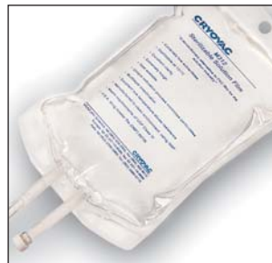
Cryovac ® Medical Films