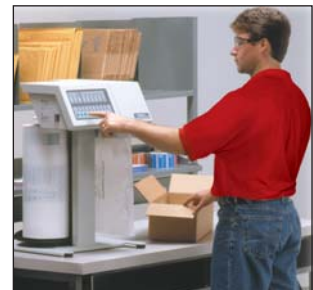
Instapacker ™ Tabletop Foam-in-Bag Packaging System