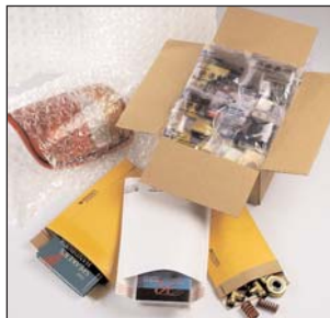
Bubble Wrap ® , Jiffy ® and Fill-Air ™ Materials, Mailers & Systems