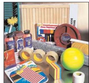
Cryovac ® Performance Shrink Films