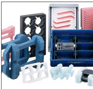
CelluPlank ® Polyethylene Foam Stratocell ® Laminated Foam