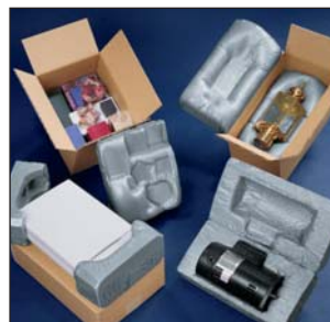
Instapak ® Foam Packaging