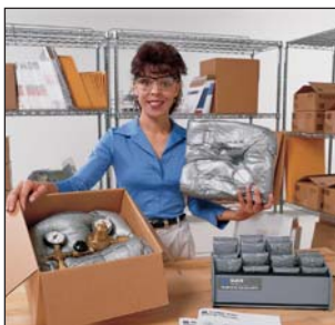
Instapak Quick ® Foam-in-Bag Packaging

Sealed Air's industry-leading investment in research and development and constant focus on World Class Manufacturing principles allow us to continue to deliver innovative packaging solutions that add measurable value to our customers' businesses around the world.