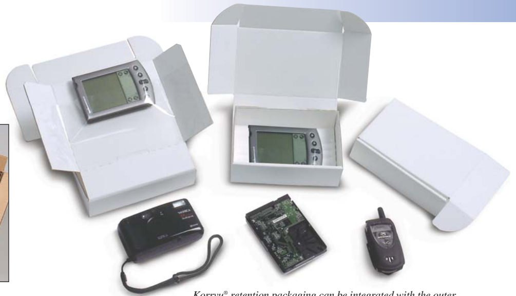
Korrvu® retention packaging can be integrated with the outer carton and printed for an 'all in one' packaging solution.