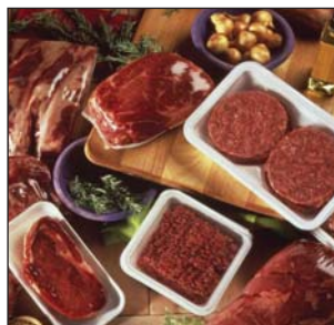
Cryovac ® Food Packaging